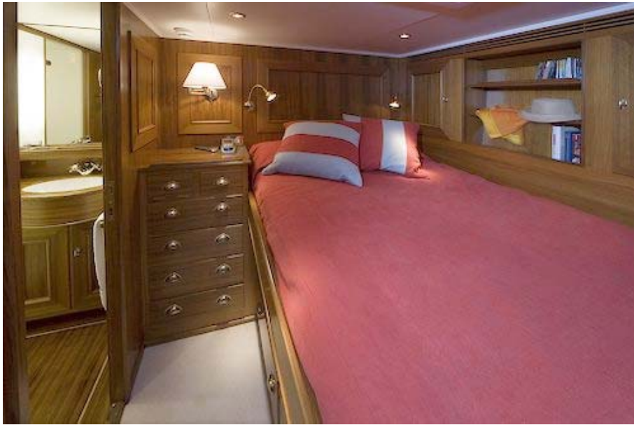
Twin guest cabin